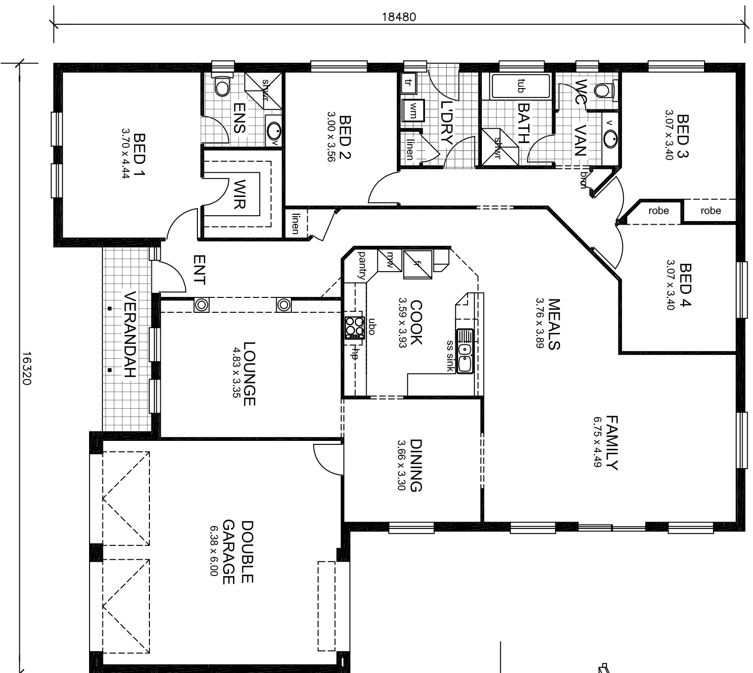
GROUND FLOOR PLAN SCALE 1:100